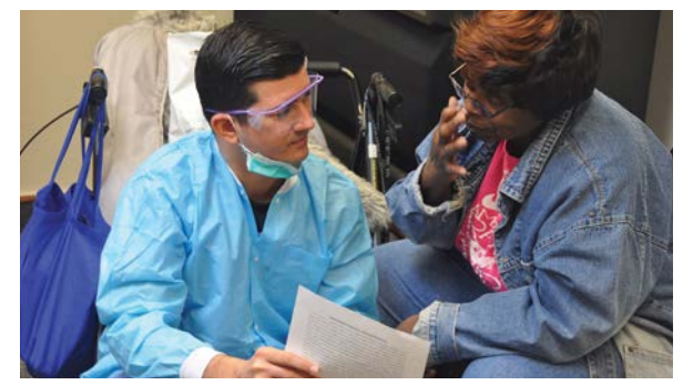
Rose Center participants received free dental check-ups thanks to a partnership with Case Western Reserve University's School of Dental Medicine.