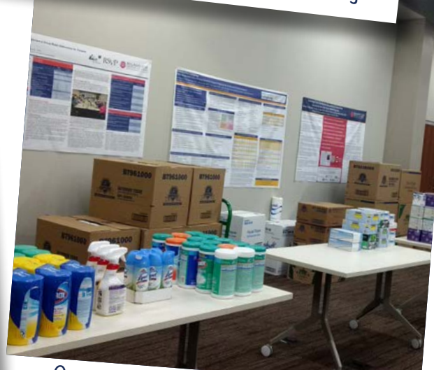
Organizations and individuals answered our call for personal care items and other necessities, as well as volunteers and needed funding to enable continued service.