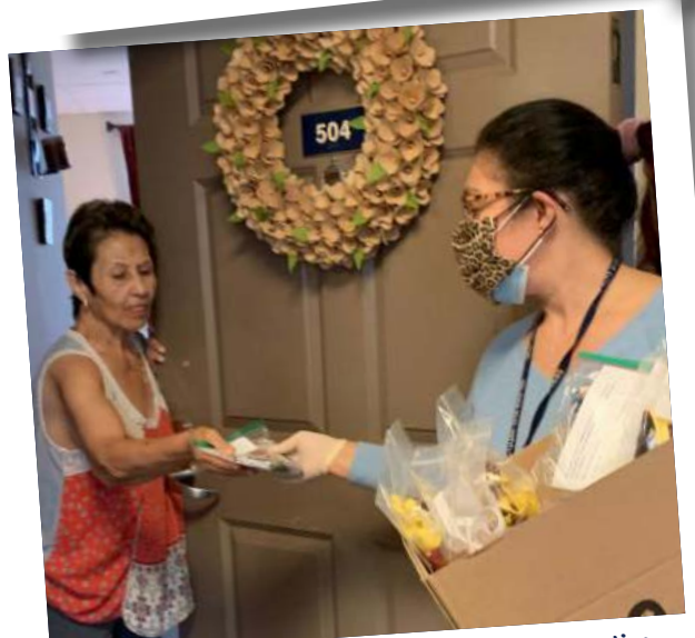
COVID-19 FAQs, resources for staying active and service updates were delivered regularly to residents at Margaret Wagner Apartments and home-delivered meals clients.