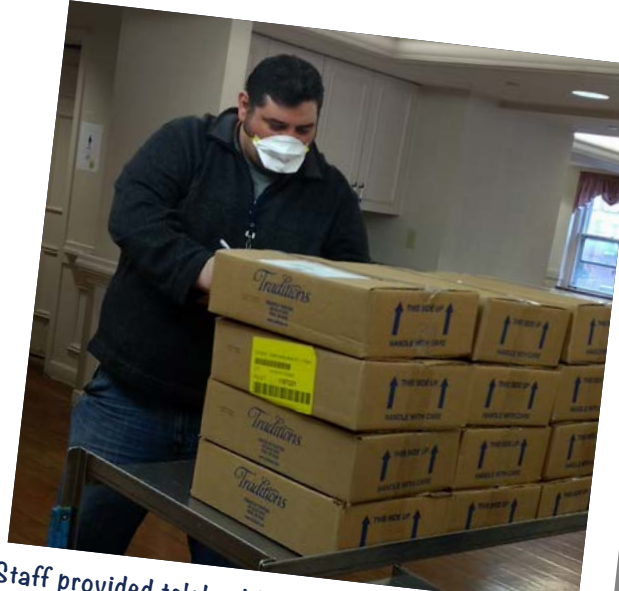
Staff provided telehealth, helped with home-delivered meals and provided telephone wellness checks and assurance calls to older adults in the community.