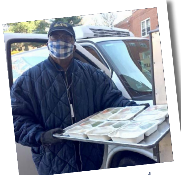
Well-positioned to respond to evolving needs.

As a nonprofit organization serving older adults and caregivers, Benjamin Rose Institute on Aging was faced with numerous challenges in the wake of the pandemic. With the strategic work undertaken in 2019 and earlier, Benjamin Rose was well-positioned to pivot services to meet the changing needs of older adults and caregivers.